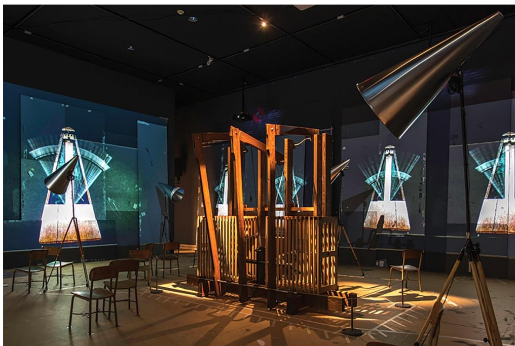
The Refusal of Time . Audiovisual Installation. William Kentridge, 2012

This presentation explores how different categories of artistic research engage with the concept of time. It examines theoretical and applied research approaches, highlighting the role of audiovisual media in artistic inquiry. Through examples that bridge art and science, the presentation delves into artistic research as a distinct form of knowledge production, emphasizing hybrid methodologies and experimental practices. The discussion will also address the poetic and reflective dimensions of research in the arts, positioning it as a 'wild' form of knowledge that challenges conventional frameworks.